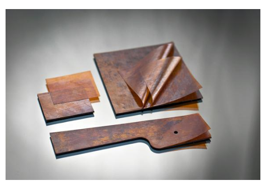
Shimco polyimide-based shims